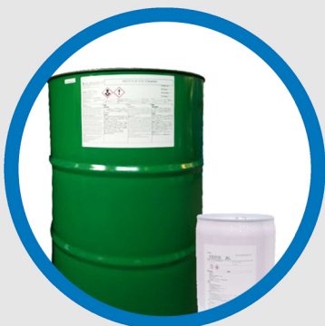
Packaging Size : 250 kg. and 25 kg.